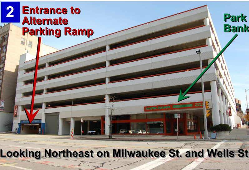
Looking Northeast on Milwaukee St. and Wells St.

The alternate parking structure is one block west of our building on Broadway Street, just north of Wells Street.